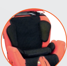
Incontinence Covers Seat Base #4116-0476-209 Backrest #4116-2476-209