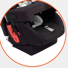
Folding Footplate SML #4116-5241-250 MED #4116-5242-250 LGE #4116-5243-250