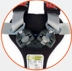
Pen-Popper Buckle #4116-6025-259