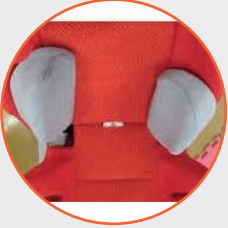
Air Mesh Cover set #4116-8880-099