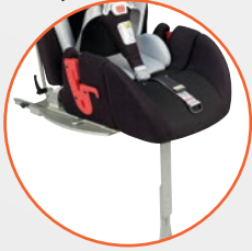
20° Tilt Wedge #4116-0291-259