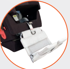
2 point Hip Belt SML #4116-6531-027 MED #4116-6532-027 LGE #4116-6533-027