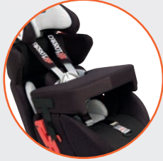
Trunk Position Pads #4116-3250-090